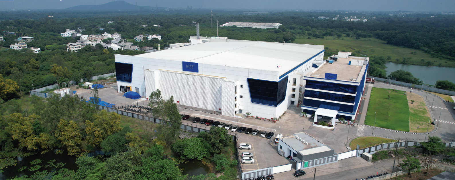
SCHOTT maintains a manufacturing hub for the pharma industry in India.